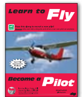
Give to a friend